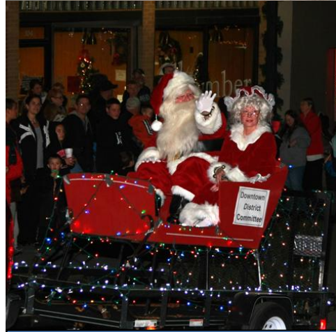
Down Town Dev. Committee